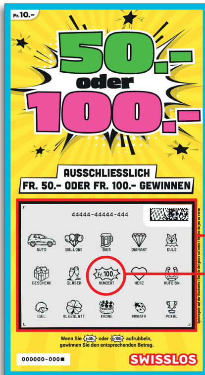
Example: Win Fr. 100.-