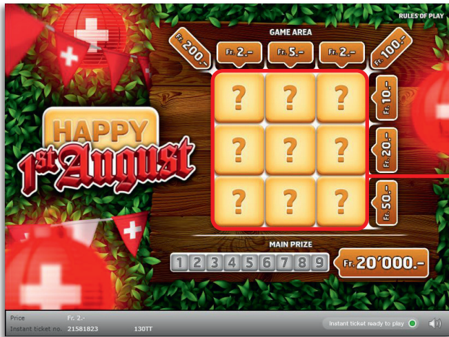
Example: Win CHF 2.–