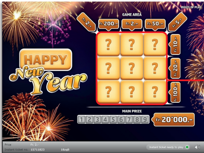
Example: Win CHF 7.-